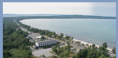
Unobstructed Water View Acreage