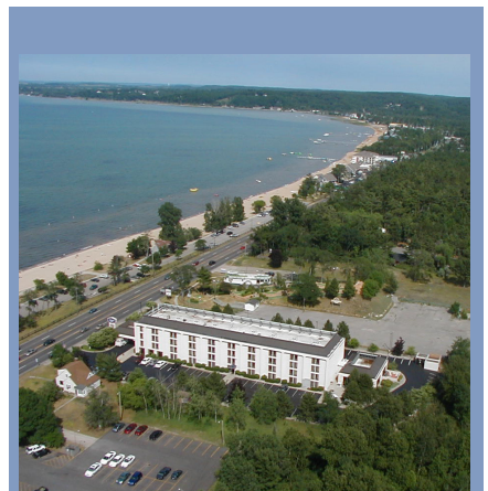
East Grand Traverse Bay

Jon Crosby, Generations Realty: 231.946.5174 www.generationsrealty.com