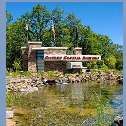
Cherry Capital Airport